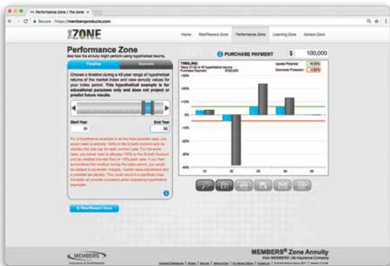
See hypothetical performance for your clients' index period.