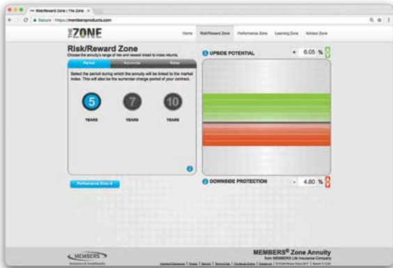
Help your clients set their investment time horizon.

Our interactive tools allow advisors to work with clients to customize a “comfort zone” of upside potential and downside protection — and close the sale of Zone.