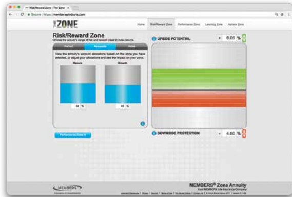
Help your clients find and set their comfort zone.